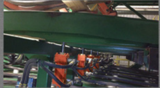
Idaho Forest Group Planer Trimmer Cut-In-Two Hold Back Lift Skid